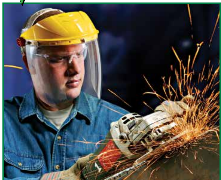
Fang-shaped VENOM visors are contoured to provide complete protection, from head to chin.